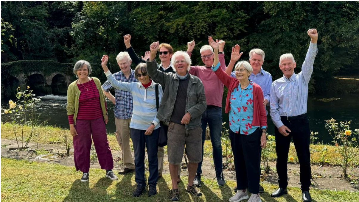
Above: The team of Stonehenge Alliance activists minus a couple of colleagues at a celebratory picnic by the River Avon, adjacent to Stonehenge World Heritage Site, enjoying a break after an intense, but ultimately successful, campaign. Below: A walk to the neighbouring archaeological site of Blick Mead where Mesolithic remains have been spared the risk of changes to water levels from construction of an adjacent flyover and tunnel.