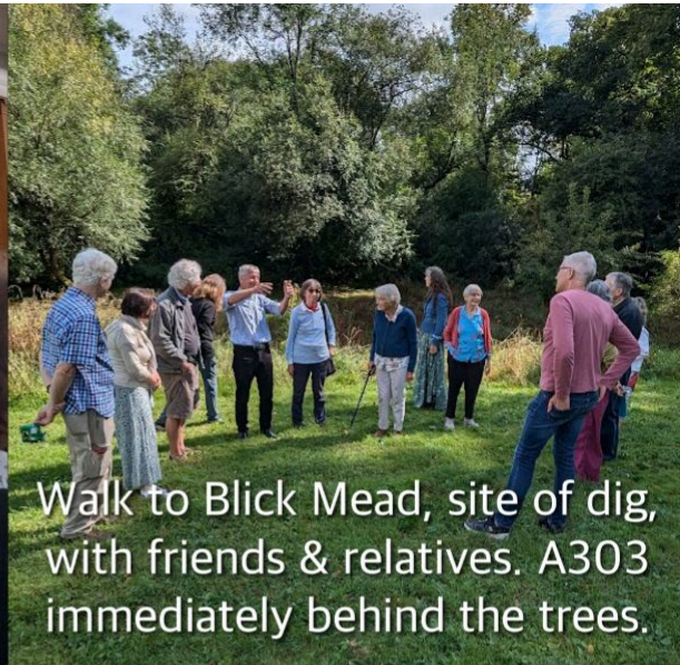
Walk to Blick Mead, site of dig, with friends & relatives. A303 immediately behind the trees.