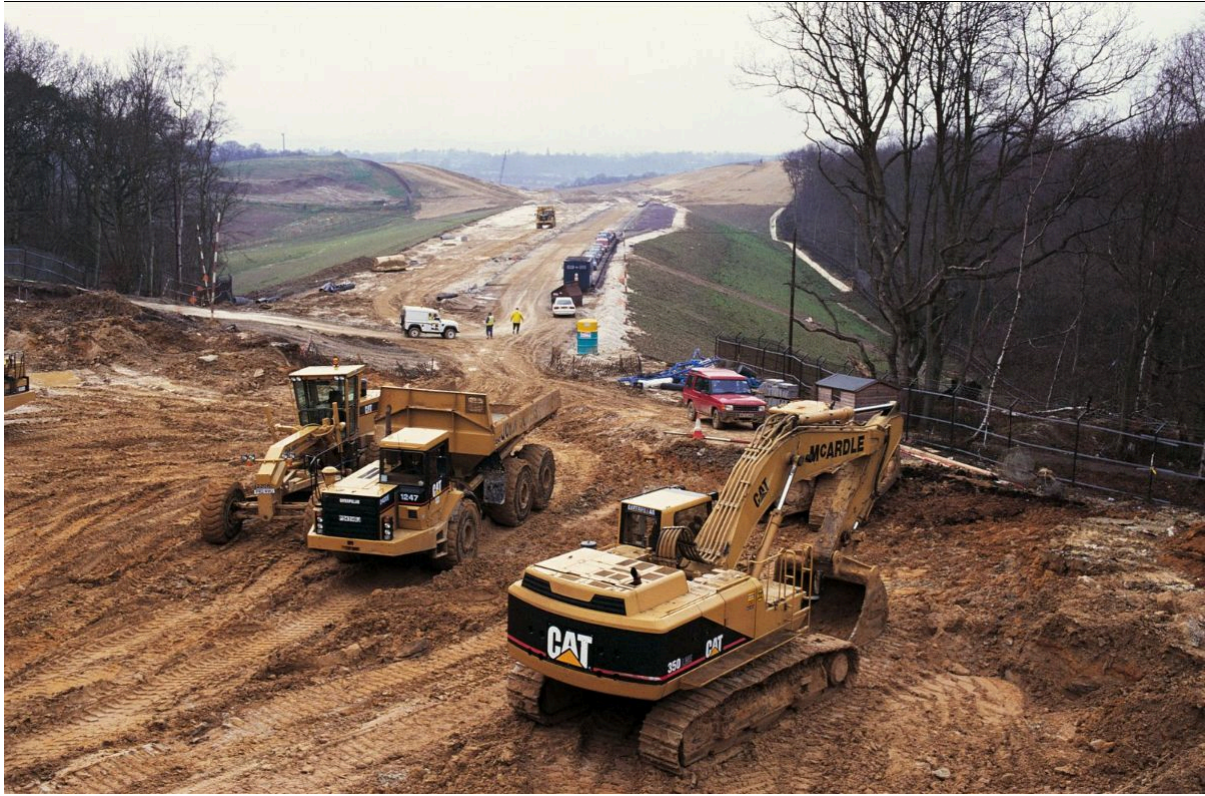
Newbury bypass in construction 25 years ago. The dual carriageway did not deliver hoped-for benefits. Photo credit Chris Gomersall for RSPB, 1996.