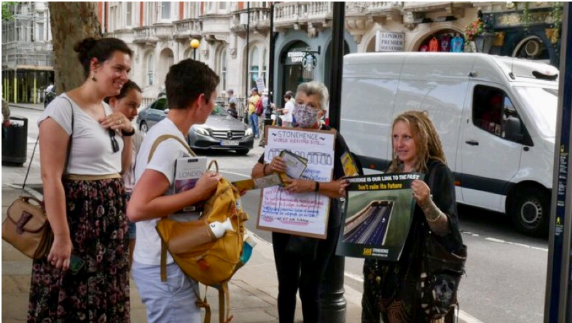
Stonehenge Alliance campaigners brought the message to Museum visitors on 14 July.