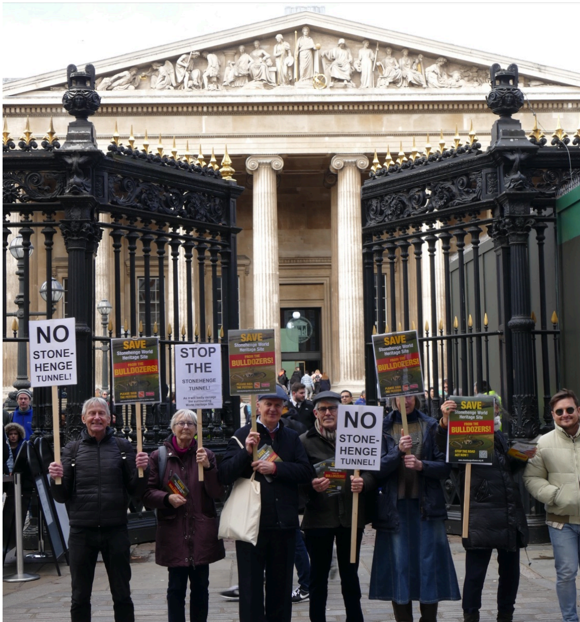
Supporters of the Stonehenge Alliance made a stand at the launch of the World of Stonehenge exhibition last February.