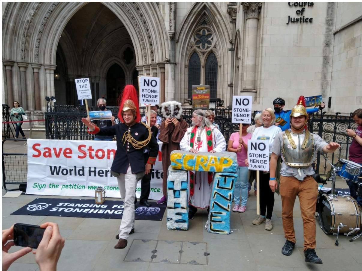
23 June 2021 - Defenders of Stonehenge come to the Royal Courts of Justice