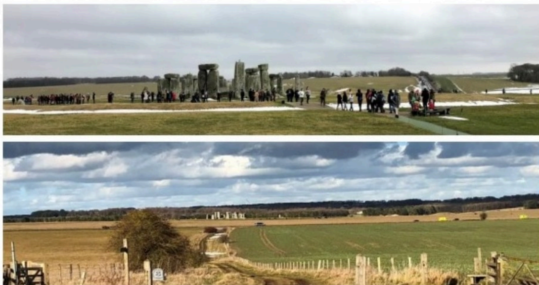
Final Report on the joint World Heritage Centre / ICOMOS Advisory mission to Stonehenge, Avebury and Associated Sites (c.373bis)

For a third time, the UK Government has invited a joint UNESCO World Heritage Centre/ICOMOS mission to Stonehenge to give specialist advice on the A303 project. Based on the 2018 Advisory Mission's findings [1] a Report and Draft Decision [2] were prepared for discussion at the annual World Heritage Committee meeting in Bahrain on 28 June 2018.