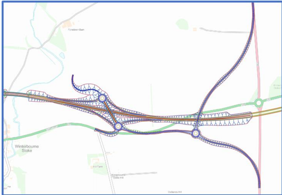
Plate 1. Bored Tunnel Extension Layout