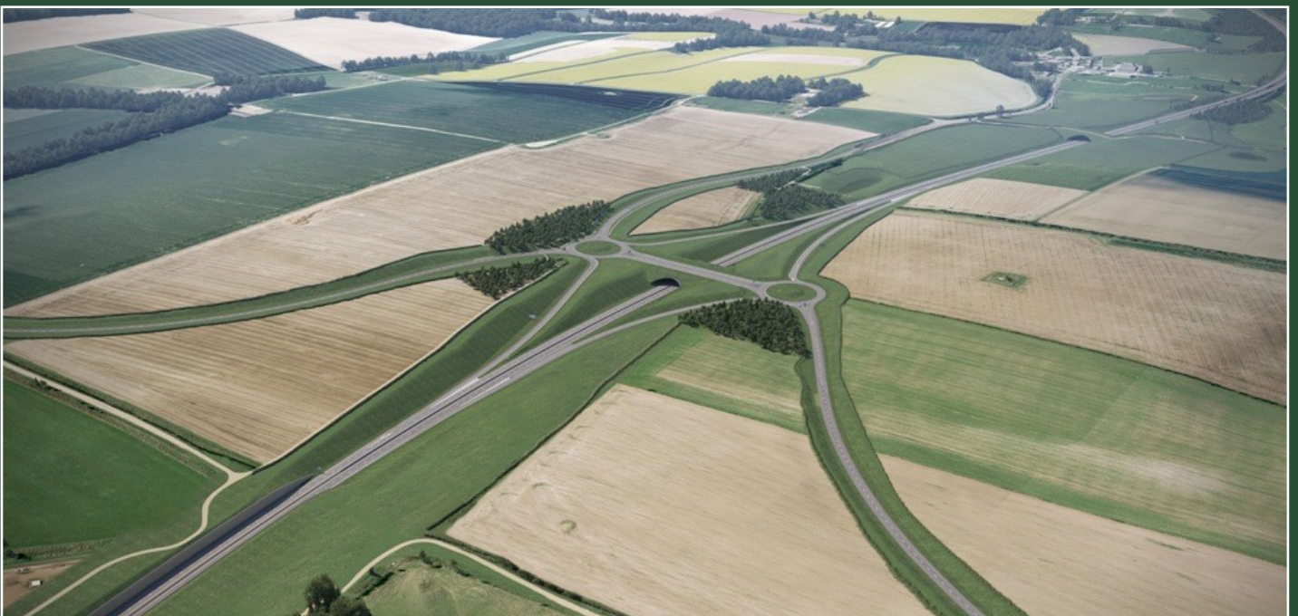
New Longbarrow interchange on the western boundary of the World Heritage Site