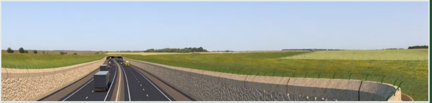
View of cutting looking east towards western tunnel portal

Lord Kennet, founder of Stonehenge Alliance.