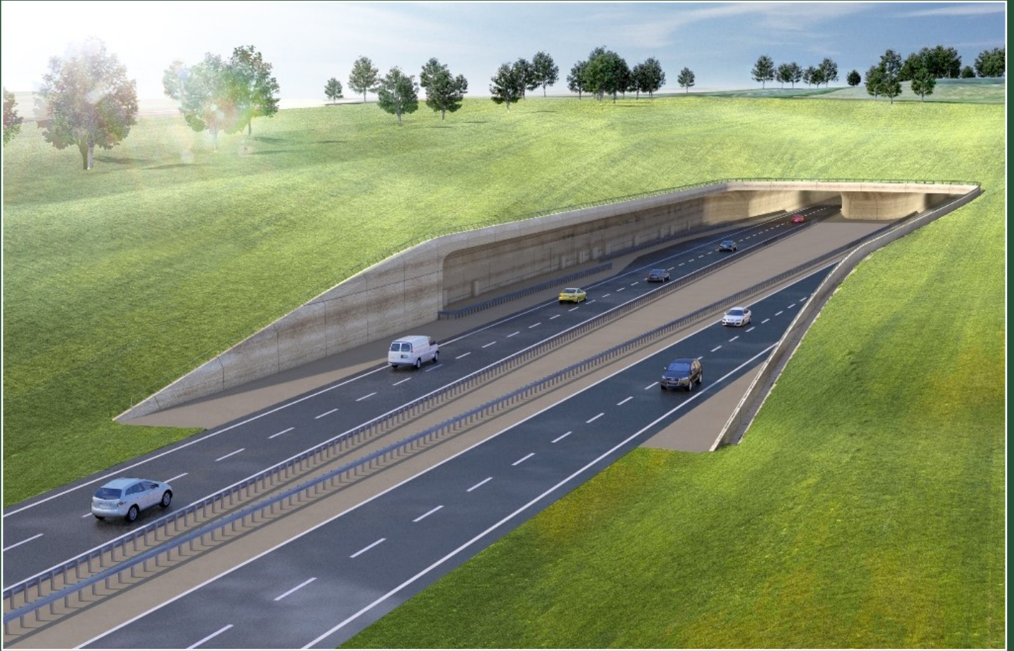
Eastern tunnel portals through land newly-purchased by the National Trust