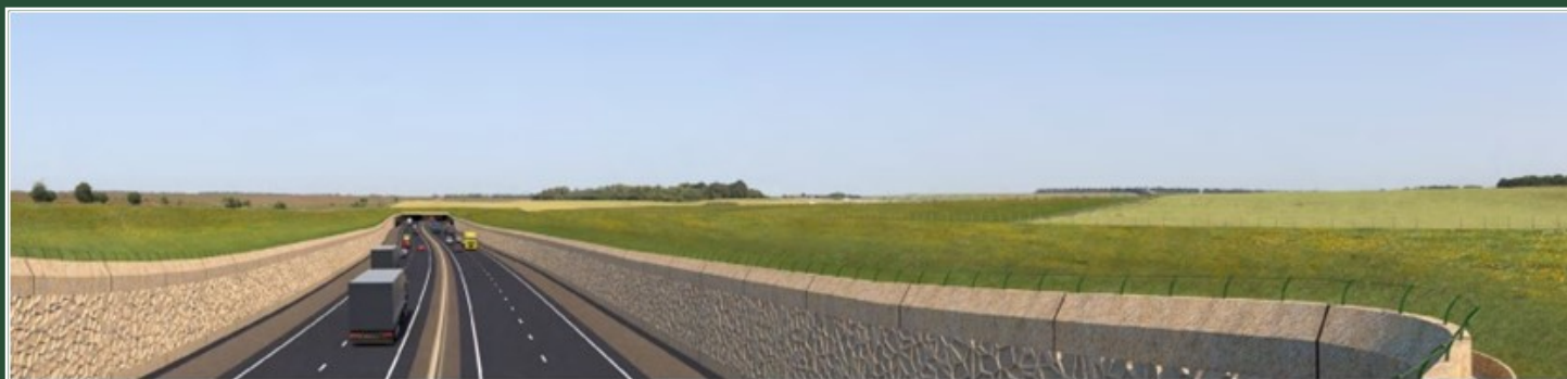
View of cutting looking east towards western tunnel portal

Lord Kennet, founder of Stonehenge Alliance.