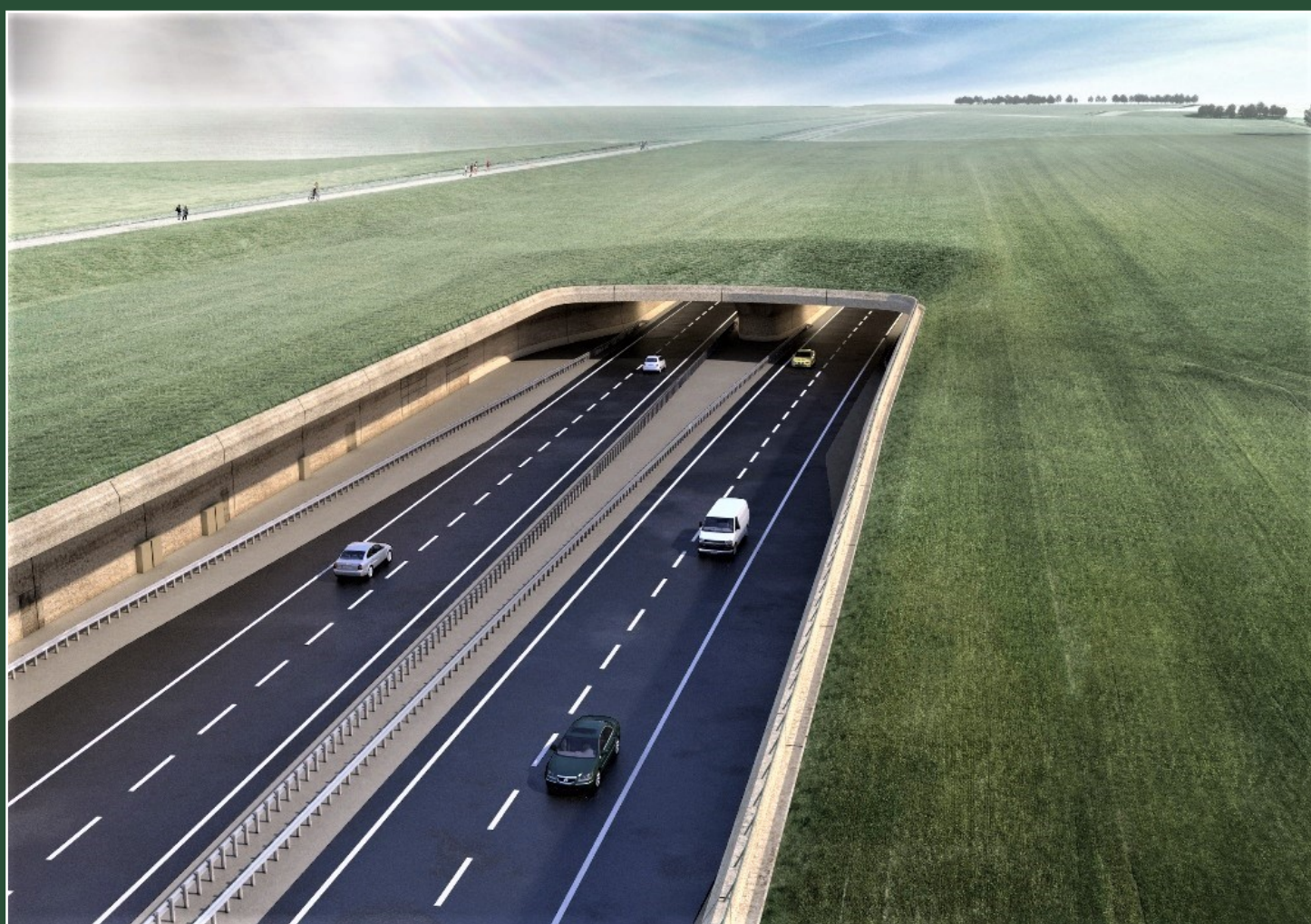
Western tunnel portal next to new Restricted Byway for pedestrians and cyclists