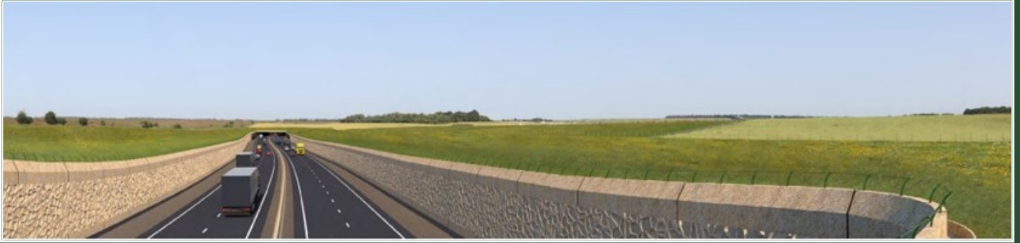
View of cutting looking east towards western tunnel portal

Lord Kennet, founder of Stonehenge Alliance.