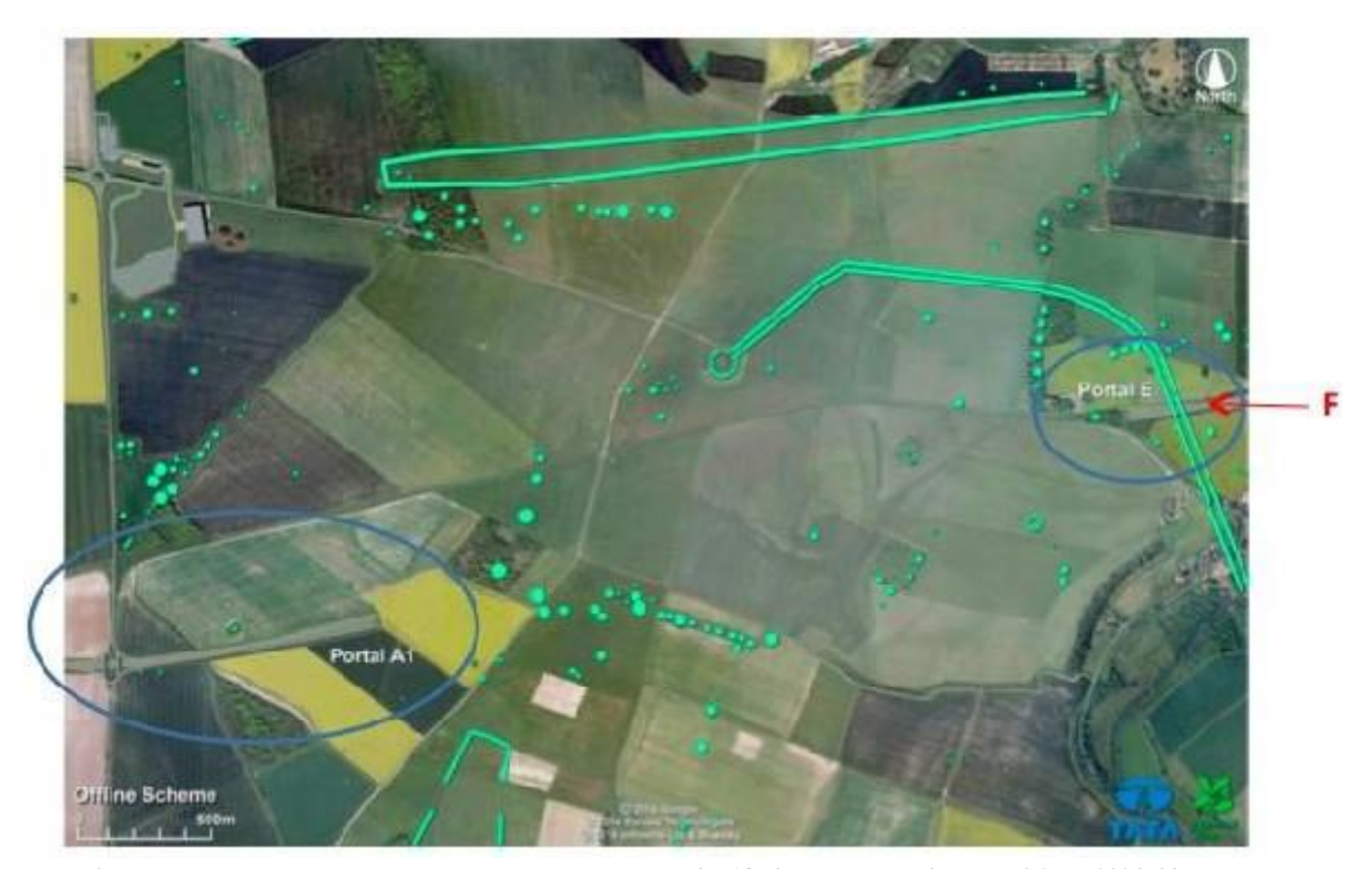
Fig. 3 showins a map of the 1.P km o tion from the Snasf.a/1& fovng report, fig. 7, p. 34 "A.3032.9km o!J7lm: bored tunnel (Tcta 2014, Apoendix D, 20r'. llishlishted in blue by the authors ore the two portt Is Aland f.If the Eastern ponal(currently proposed point 'f') was further to the east of the l<ing lfarrow ridges (point 'F') it would not cut through the Avenue and this would signifkantiV reduce the adverse impacts on the A·lenue which is a major feature of the World Heritage site.