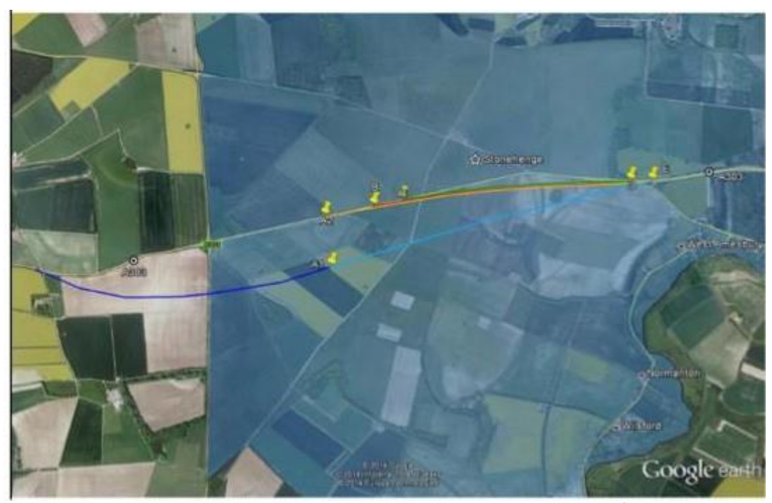
FIII loudolliOf tvnn*l pornI*for 2:llo:m 5MtblllhMt tch*m*(PoulC & OJ,2:Sio:m line tunnel (Pol\ah E & 1),t.tlim line t\lftM!t (Port.. [ & AZ), z.tkm of HIM tunMl (POf)*1 f & All \Gamma & tt 2:014, Apptf\dbcll, t)