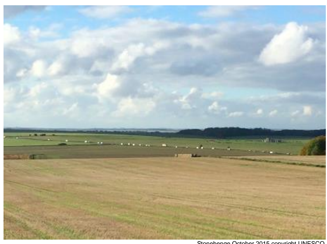
Stonehenge October 2015