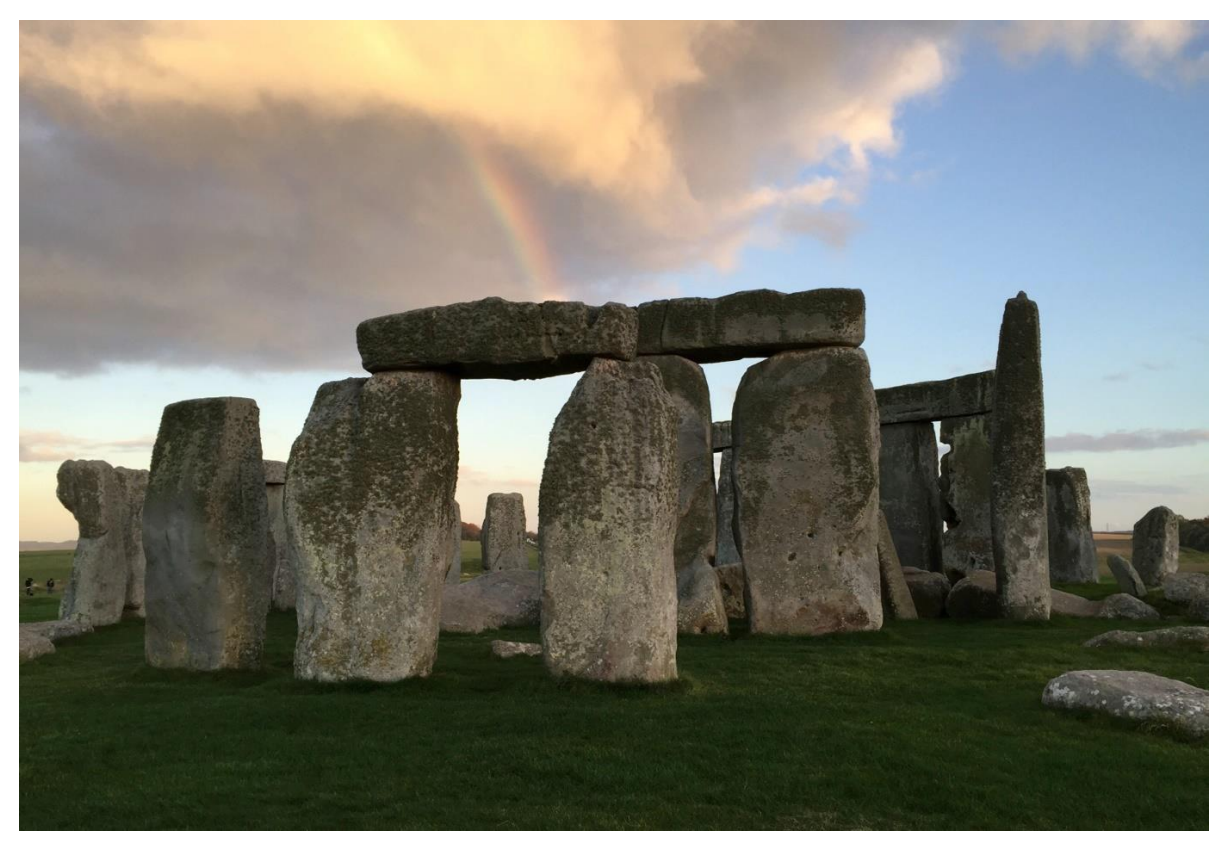
Stonehenge October 2015