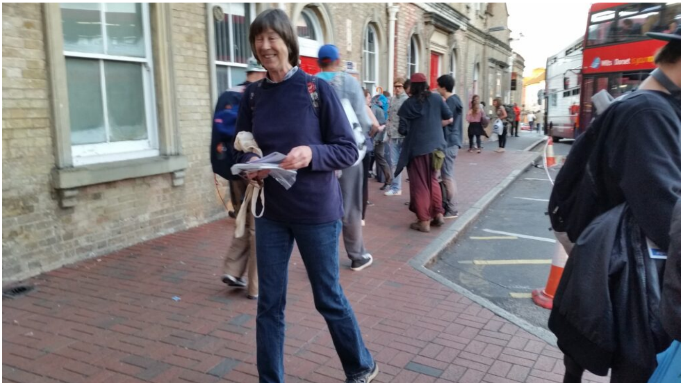
Leafleting solstice goes queuing for the shuttle bus, Salisbury Station. June 2015