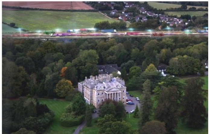
TOP L: Western tunnel portal with pedestrians on old A303 as a byway (image: Highways England). TOP R: New Longbarrow interchange (image: Highways England). BOTTOM L: Eastern tunnel portal below ancient Stonehenge Avenue (image: Highways England). BOTTOM R: Planned flyover beside Listed Amesbury Abbey and Blick Mead Mesolithic site (image: private photomontage).